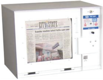
Model 49 (Coin Operated)