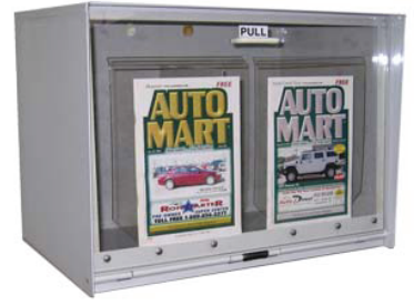
49 DW (1 Plastic Door)