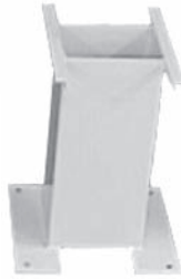
MP2 PEDESTAL 19" HIGH