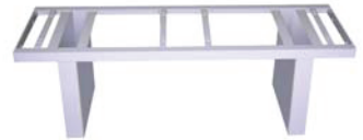
#2 VEGAS BASE 15 1/4" H x 48 1/2" L