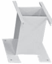
MP1 PEDESTAL 15 1/4" HIGH