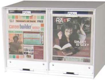
49 DW2 (With 2 Plastic Doors)