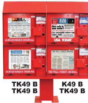
TK49 B TK49 B K49 B TK49 B