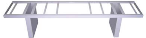
#3 VEGAS BASE 15 1/4" H x 72 3/4" L